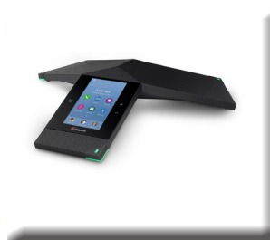
Poly Trio 8800

Granite's Hosted Voice solution can offset the rising cost of copper phone lines. Customers can realize the benefits of a VoIP solution without having to upgrade their premise equipment. Granite's Hosted Voice provides an analog handoff compatible with any analog phone and many key systems and PBX's.